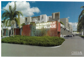
TWO BEDROOM RESIDENCE 847 SQUARE FEET • 200 SQUARE FEET POOL CI$ 399,000