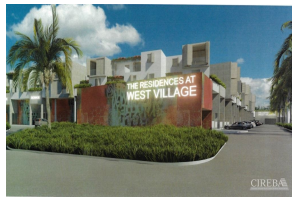
TWO BEDROOM RESIDENCE 847 SQUARE FEET • 200 SQUARE FEET POOL CI$ 399,000